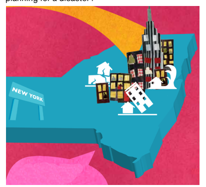
Booklet detail showing potential New York disasters